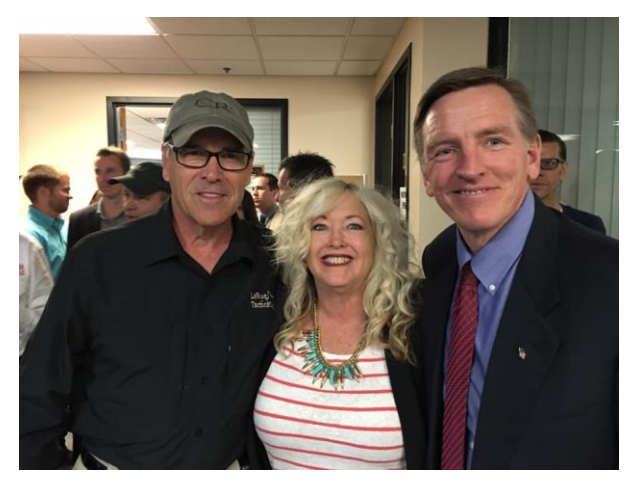
Had a great meeting this week with Canadian Parliamentarians from the Inter-