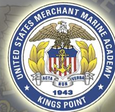
U.S. MERCHANT MARINE ACADEMY