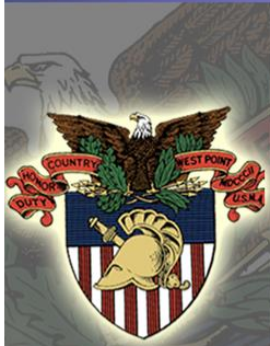
U.S. MILITARY ACADEMY