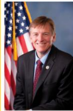
Congressman Paul A. Gosar, D.D.S. Representing Arizona's Fourth Congressional District

Other awards include college scholarships.