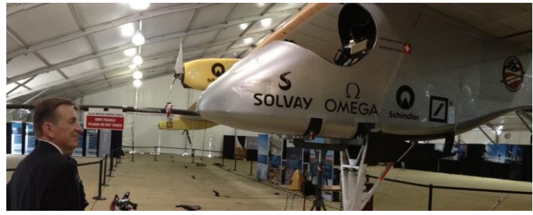
(Rep. Gosar views the Solar Impulse up-close, June 17, 2013)

A week ago, I had the opportunity to view up-close the Solar Impulse, a solar-powered airplane that just completed a coast-to-coast trip in 45 days. This zero-fuel plane landed at the Washington Dulles International Airport. Congratulations to pilots André Borschberg and Bertrand Piccard. Please read more HERE.