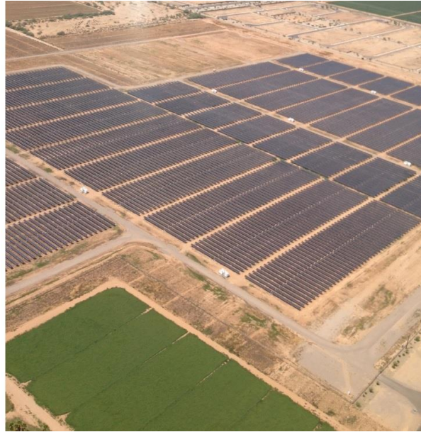
(The Copper Crossing Solar Ranch in Florence, Arizona)

I had a great visit to the Copper Crossing Solar Ranch, which overlooks 144 acres of solar panels in Florence and powers more than 3,400 homes. I will continue to support an all-of-the-above energy policy, which includes important facilities such as this one.