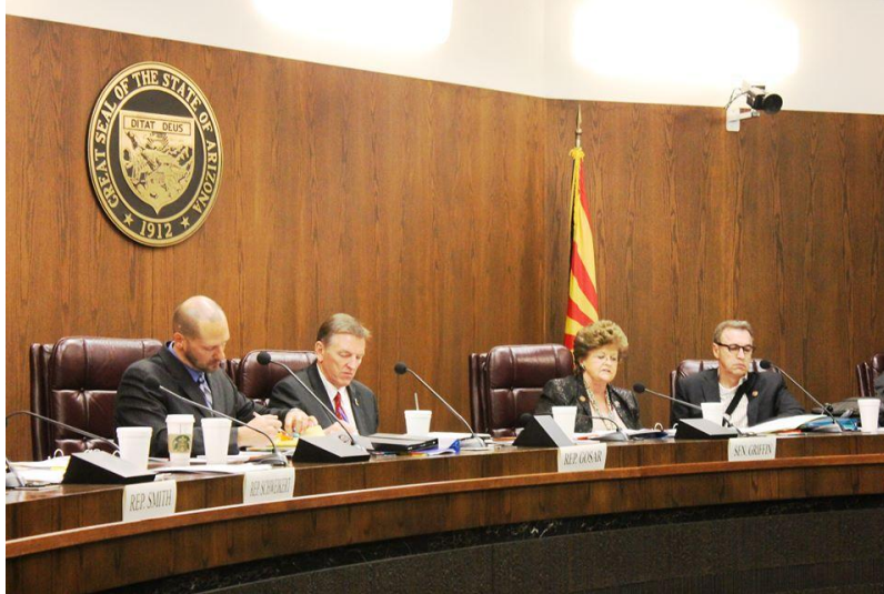
(Rep. Gosar, second from the left, with other leaders of the EPA Joint Field Hearing)