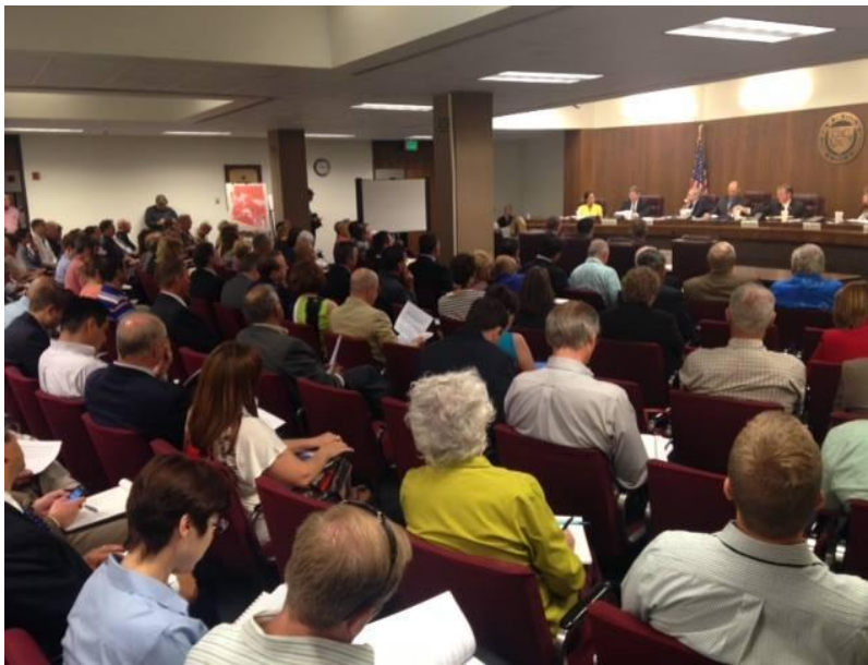
(Audience members looking on at the EPA Joint Field Hearing)