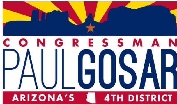
Paul A. Gosar, D.D.S. Member of Congress