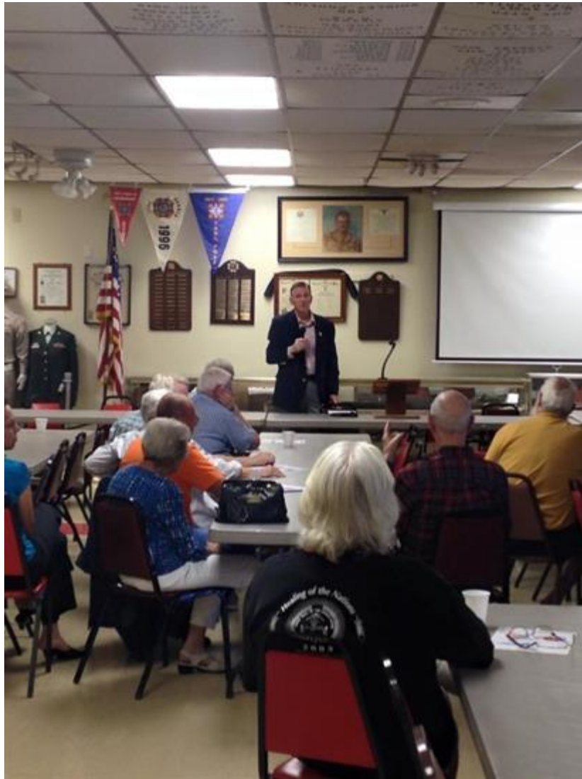
Speaking with the Association of Mature American Citizens (AMAC) at the VFW in Cottonwood. AMAC is a growing organization that focuses on developing solutions to important issues facing senior citizens such as Social Security, healthcare and VA accountability.