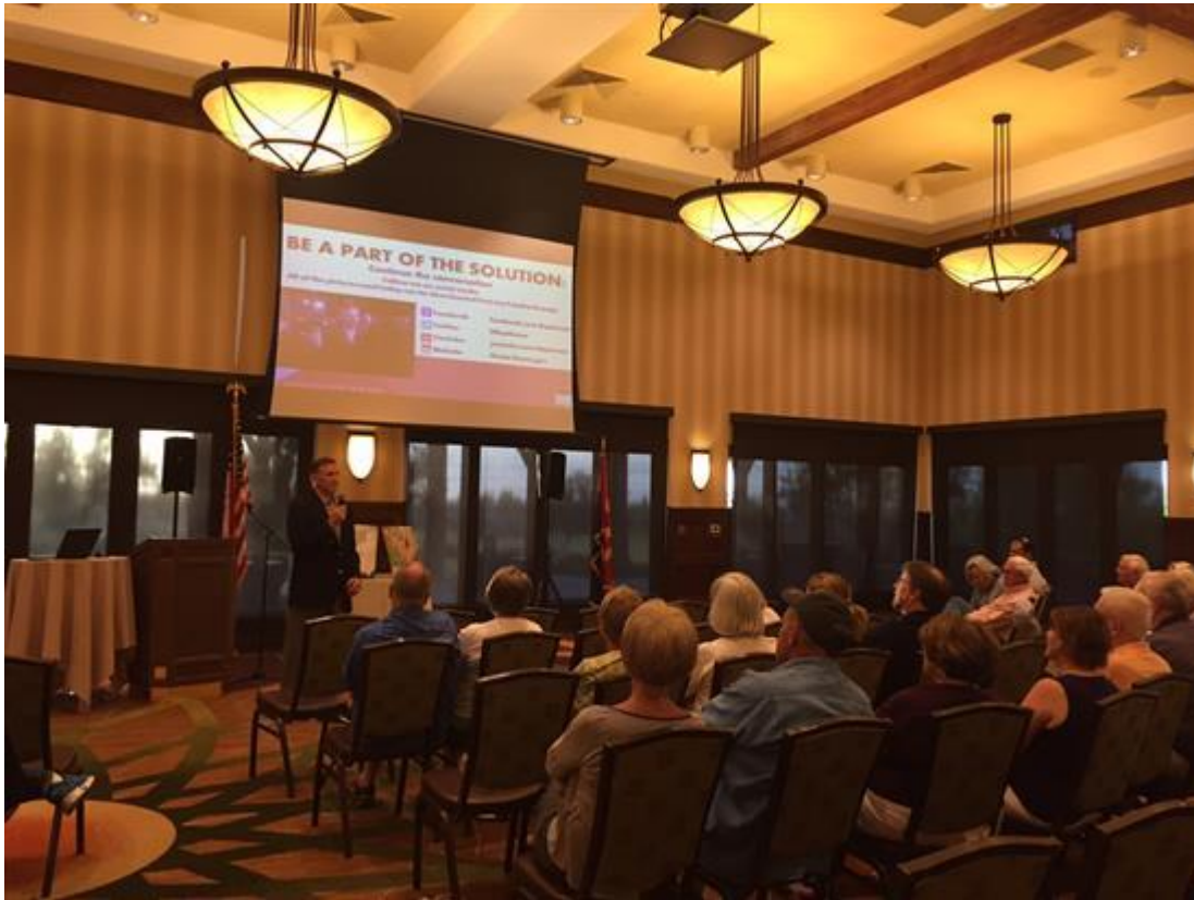
Meet and Greet at Encanterra Country Club in San Tan Valley. We covered topics relating to our national budget and how to cut federal waste, fraud and abuse.

It was my great privilege to participate in the Memorial Day Remembrance Ceremony at the Prescott National Cemetery paying tribute to our fallen heroes. It was an incredibly humbling experience to stand on this hallowed ground where so many patriots have been laid to rest.