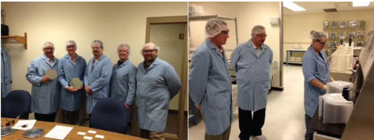
Visiting the Pure Wafer facilities in Prescott. A wafer is a thin slice of semiconductor material which serves as a critical part of many electronic devices.