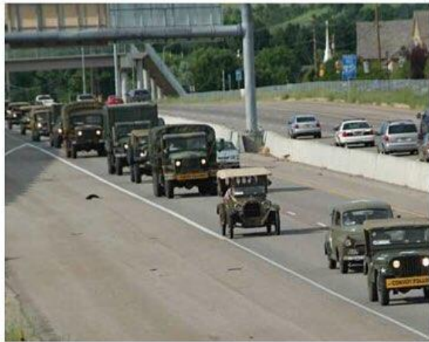
Spent a great evening Thursday night with American Legion Post 19 in Yuma as we celebrated the 95th anniversary of the Historic Military Vehicle Convoy.