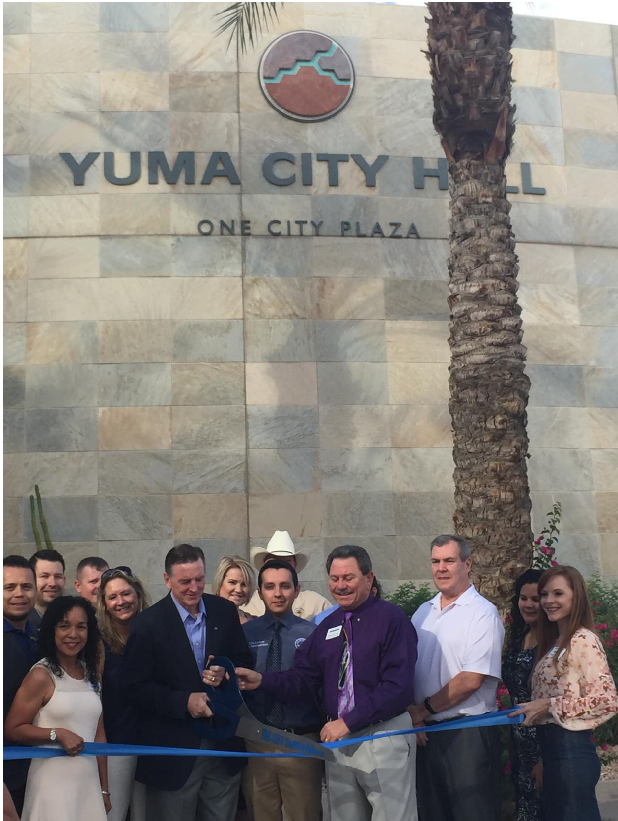
Celebrating the ribbon cutting ceremony and grand opening of my new Yuma office last Thursday.