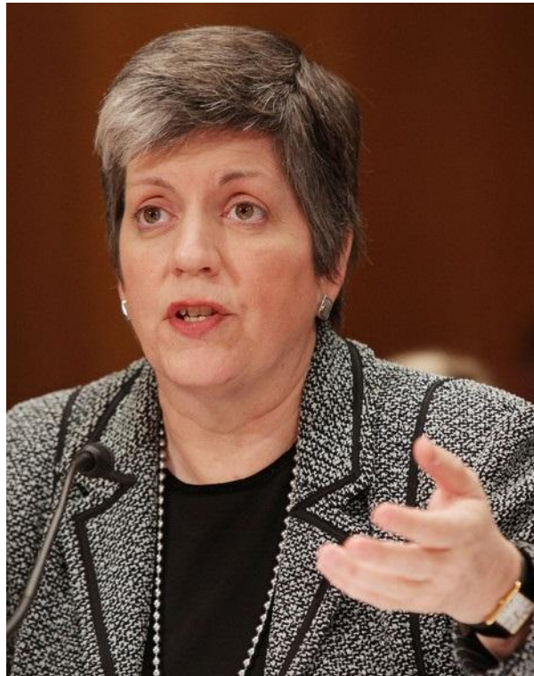
Secretary Napolitano.

Last week, I joined my colleagues in sending a letter to Secretary Janet Napolitano expressing my concern over the hundreds of illegal immigrants recently released due to sequestration.