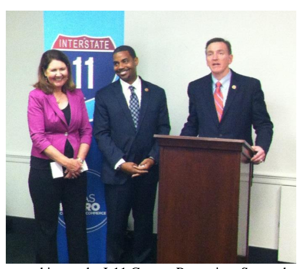
(Rep. Gosar speaking at the I-11 Caucus Reception, September 18, 2013)

On Wednesday night, I celebrated the launch of the I-11 Caucus, which will bring together members of both parties who share my interest in the swift development of this highway. Phoenix and Las Vegas are the largest cities in the nation not linked by an interstate highway corridor. The development of the I-11 corridor will foster economic development and tourism in our state.