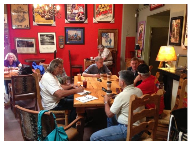
(Rep. Gosar speaking with constituents in Cave Creek, September 16, 2013)