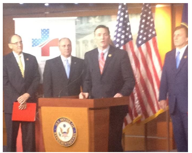
(Rep. Gosar speaking at RSC press conference, September 18, 2013)

Wednesday afternoon, I spoke at the Republican Study Committee (RSC) press conference where we unveiled the Republican alternative to Obamacare, The American Health Care Reform Act. Click <u>HERE</u> to read more in The Arizona Republic . One of the great things about this bill is its emphasis on market competition. Market competition lowers costs, increases access and improves quality of care. Click <u>HERE</u> to read more in The National Review .