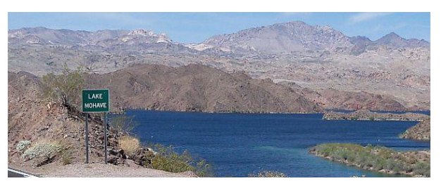
(Lake Mohave)

Mohave County has more than 1,000 miles of shoreline along the Colorado River and its lakes. This is more shoreline than any other county in the nation.