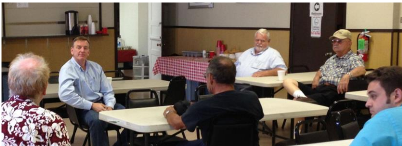
(Rep. Gosar speaks with Yarnell fire victims in Wickenburg, July 8, 2013)

I also visited Wickenburg to meet with those displaced by the Yarnell fire. The community was beyond welcoming and my heart goes out to those who have lost so much.