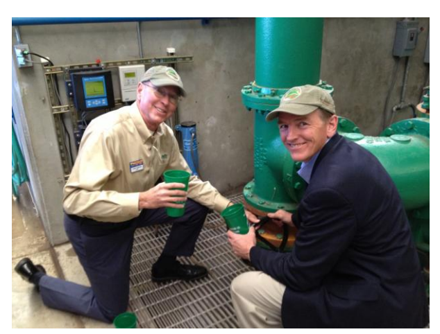
Congressman Gosar with City of Flagstaff Mayor Nabours getting a drink from the Inner Basin drinking water Pipeline

On Thursday, Mayor Nabours of the City of Flagstaff and I enjoyed glasses of water from the city's newly fixed Inner Basin drinking water pipeline. If this pipeline was not repaired and the city continued to experience drought conditions, the city would have been faced with potential water rationing.