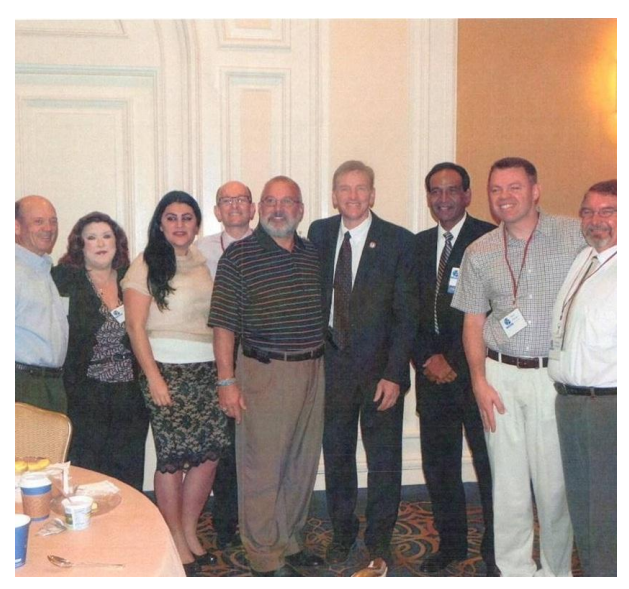
Congressman Gosar recently talked about the need to repeal and replace Obamacare with doctors at a Sleep Apnea event.

Doctors realize the devastating effects Obamacare will have on our health care system if it is not repealed and replaced.