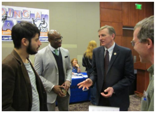
The D.R.E.A.M. Job Fair had a great turnout. To see photos from this event please click above or <u>here</u>.

Arizonans are resilient, creative and hard-working, and I want to thank everyone who participated in this event to empower our local economy.