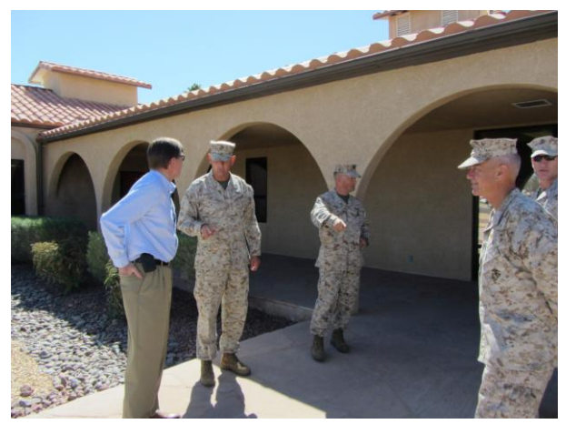
In Article I, Section 8 of the U.S. Constitution, the founding fathers empowered Congress to: "Provide for the common Defense..."

I was honored to receive the <u>Champion of National Security</u> <u>Award</u> from the Center for Security Policy. I received a score of 100% and I tied for best in the Arizona delegation.