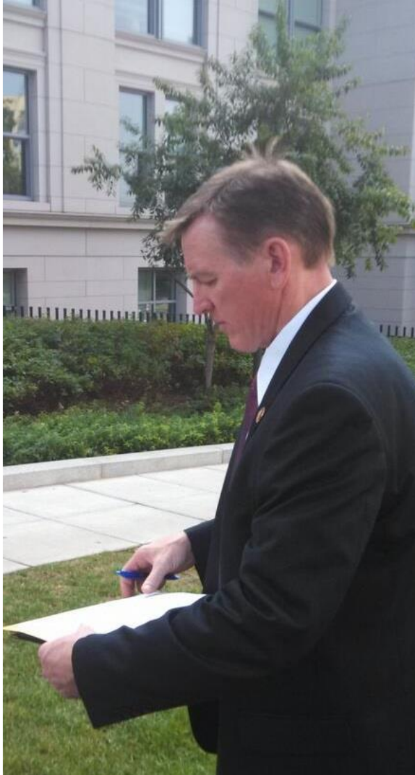
(Rep. Gosar signing the letter to State Department officials, September 11, 2013)

The letter asked for the State Department's assistance in expediting the investigation into what happened the night of the Benghazi terrorist attack, which left four Americans dead. Click HERE to view a copy of the letter and click HERE to read more about my visit in the National Review . Two other conservative publications also covered my visit, Breitbart and Rare .