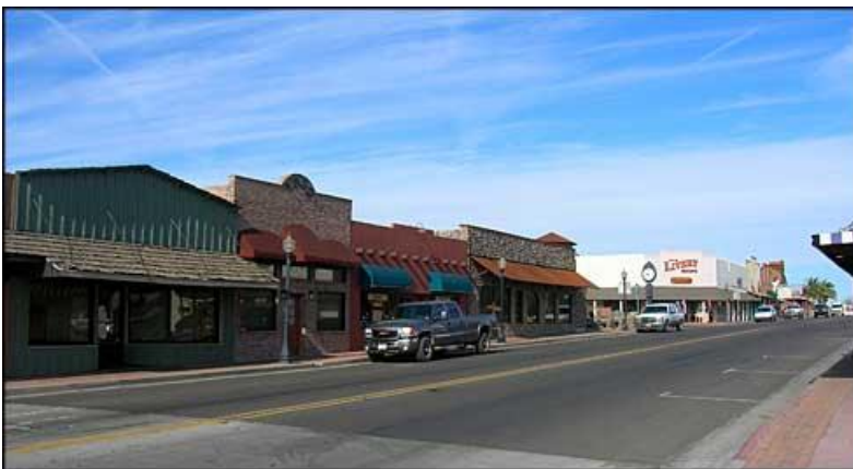
(Downtown Wickenburg)

Wickenburg was once the third largest town in Arizona. It missed becoming the territorial capital by two votes in 1866.