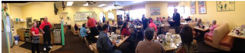
(Rep. Gosar speaking to constituents at Sally B's in Prescott Valley, April 22, 2014)

I held two Small Business Fridays yesterday, one in Prescott Valley and one in Prescott. I was happy to see so many smiling faces at both of these events. From ObamaCare to the massive federal debt, we discussed all the major issues facing small business owners and entrepreneurs. These are the businesses that drive our economy, so it's vital that the federal government get out of their way.