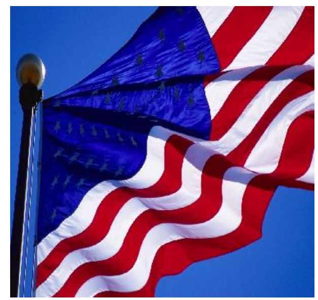
The recent bombing in Casa Grande reminds us that we all have a responsibility to be vigilant and to alert authorities of any threats in our communities.

No amount of violence will deter the American people from their unshakeable faith in God, our Constitution, and our true American values.