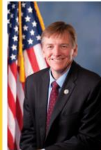
Congressman Paul A. Gosar, D.D.S. Representing Arizona's Fourth Congressional District

Other awards include college scholarships.