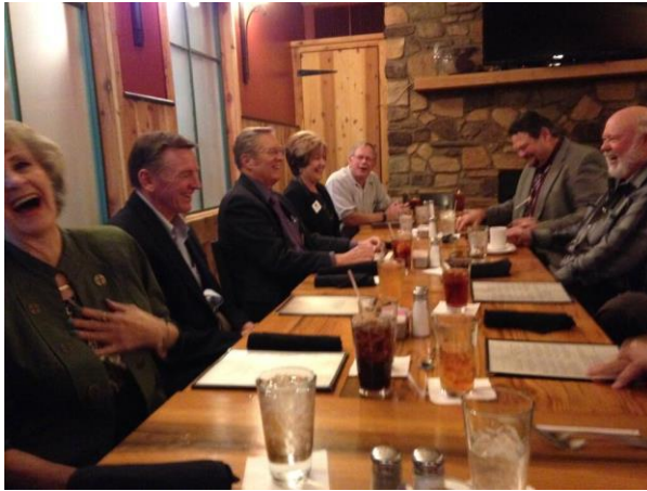
(Rep. Gosar meeting with the mayors of Prescott Valley, Dewey and Chino Valley, March 10, 2014)

I also thoroughly enjoyed meeting the teams of two District 4 health care facilities: the Prescott DaVita Dialysis Center and the Payson Care Center. These state-of-the-art facilities provide comfort and care for people going through some tough physical challenges and the number of patients smiling during their treatment was extremely encouraging.