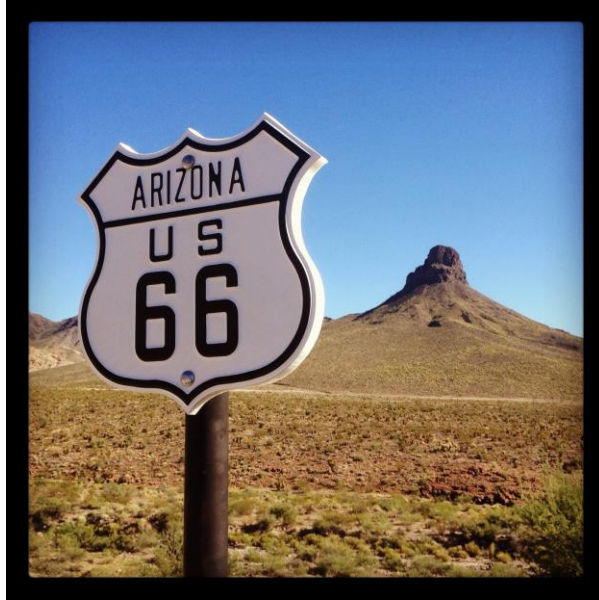
(Route 66 near Selligman)

Route 66's longest remaining intact stretch is between Selligman, AZ and Topock, AZ.