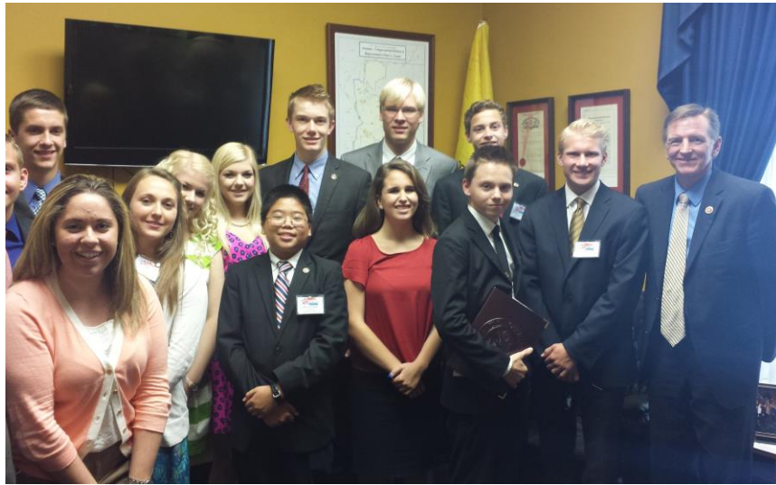
Arizona Teenage Republicans (TARS)