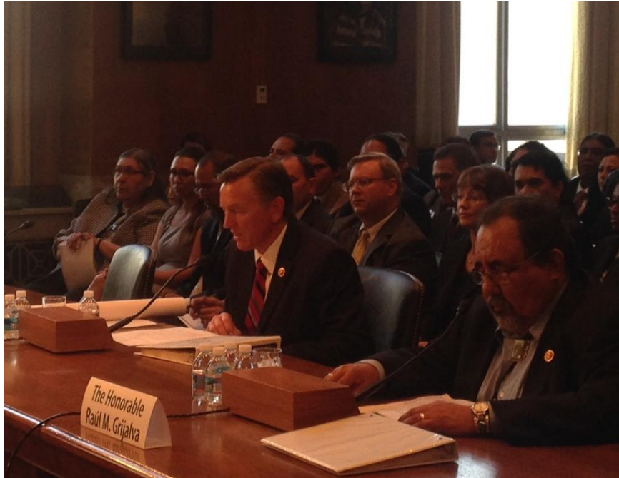
(Rep. Gosar testifying before the Senate Committee on Indian Affairs)

Tohono O'odham Nation's dismissal of their promise to build no additional casinos in Phoenix.