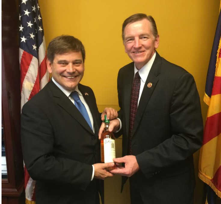
Member of Parliament, Andrew Bridgen, representing North West Leicestershire, England, presenting me with a bottle of scotch signed by British Prime Minister David Cameron.