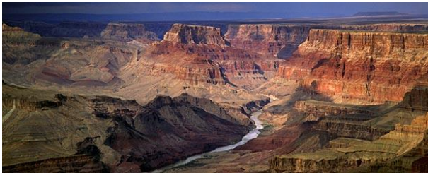
(The Grand Canyon,)

In 1869, John Wesley Powell, an American explorer, led the first expedition down the Grand Canyon. What had previously been referred to as the "Big Canyon" or "Great Canyon", he called the "Grand Caynon".