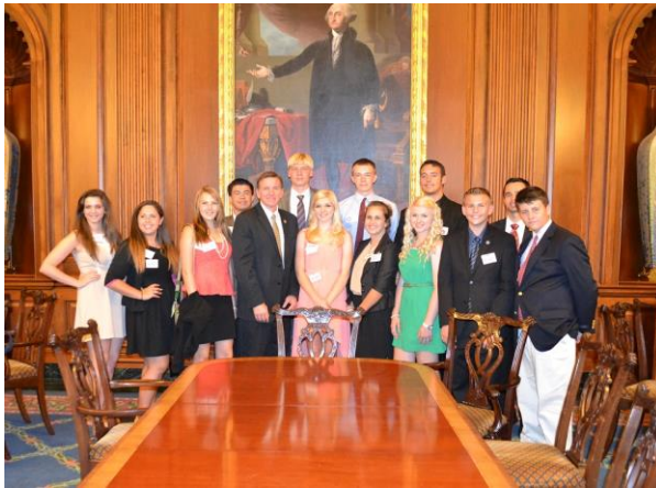
(I posed for a picture with Arizona TARs in the Capitol, July 18, 2013)

On Thursday, I spoke to a group of Arizona Teen Age Republicans, who were visiting Capitol Hill. I talked about the importance of getting government out of the way, so the private-sector can flourish and create jobs. I also expressed my optimism about America's future. After all, it's always darkest before dawn. I thoroughly enjoyed spending time with our nation's next generation of leaders.