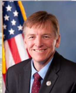
Dr. Paul Gosar (AZ-4)