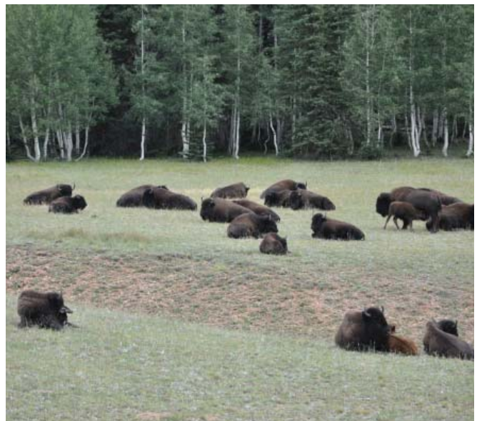
Bison in the Little Park Meadow adjacent to the North Rim Entrance Road.