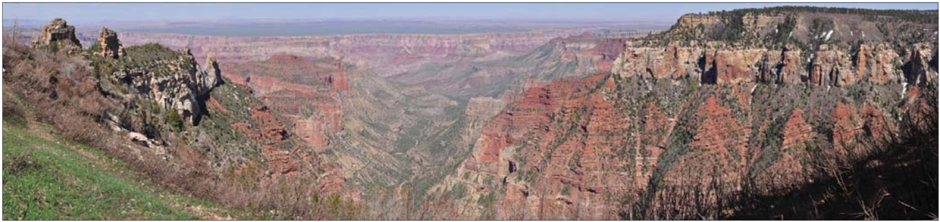
View from Roosevelt Point