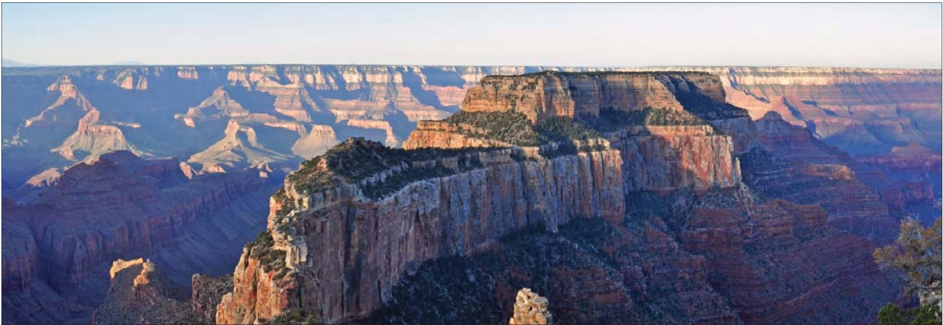
Sunrise from Cape Royal on the North Rim