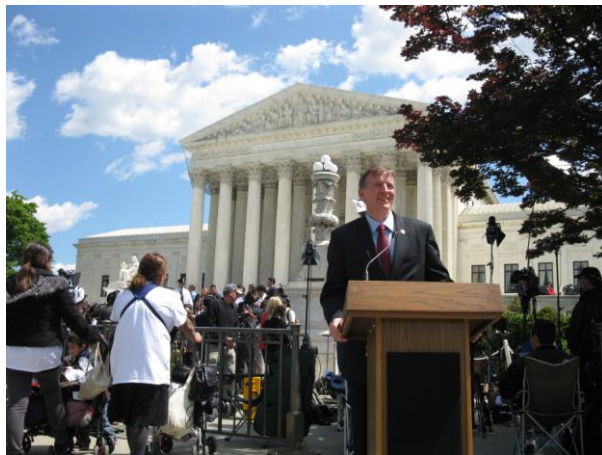
We are still waiting for the Obamacare and S.B. 1070 Supreme Court decisions