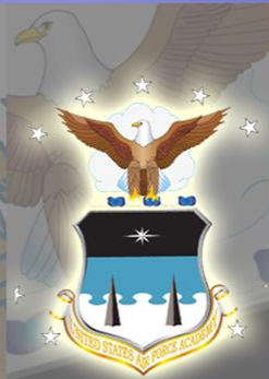
U.S. AIR FORCE ACADEMY