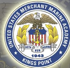
U.S. MERCHANT MARINE ACADEMY