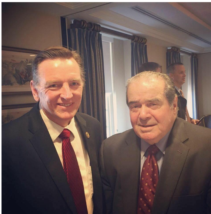
(Congressman Gosar pictured with the late Supreme Court Justice Antonin Scalia.)

As your Congressman, I will fight to reclaim the lawmaking responsibility of the legislative branch and ensure that the proper separation of powers is maintained.