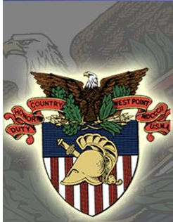
U.S. MILITARY ACADEMY