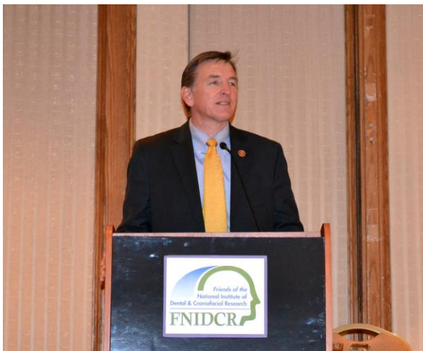
(Rep. Gosar speaking at the luncheon, November 21, 2013)