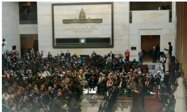
(Emancipation Hall in the Capitol Visitors Center is packed for the ceremony, November 20, 2013)

On Wednesday, I attended the Congressional Gold Medal ceremony in honor of Native American Code Talkers. These Native Americans transmitted code based on 33 tribal dialects during combat operations in World War I and II. I am humbled by their courage and sacrifice, especially to a nation that did not always allow them the same rights for which they fought. It was an honor to attend the ceremony.