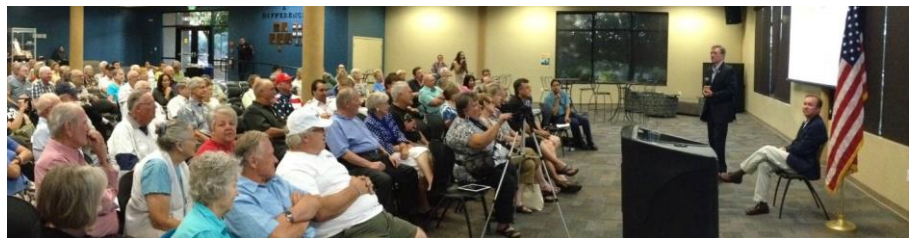
(Rep. Gosar and Rep. Mulvaney discuss the economy at a joint town hall in Prescott, June 25, 2013)

Earlier this week, residents in Prescott packed the Student Union Building at Embry-Riddle Aeronautical University to participate in a joint economic town hall I hosted alongside Rep. Mick Mulvaney. Local entrepreneurs, business owners, and concerned constituents made it clear that the best economic environment is one with less federal government.