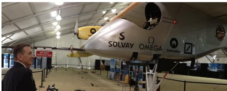
(Rep. Gosar views the Solar Impulse up-close, June 17, 2013)

A week ago, I had the opportunity to view up-close the Solar Impulse, a solar-powered airplane that just completed a coast-to-coast trip in 45 days. This zero-fuel plane landed at the Washington Dulles International Airport. Congratulations to pilots André Borschberg and Bertrand Piccard. Please read more HERE.